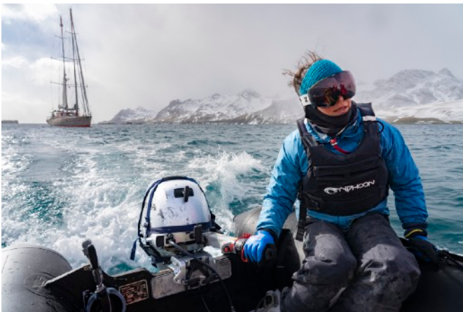
Going ashore at Husvik.