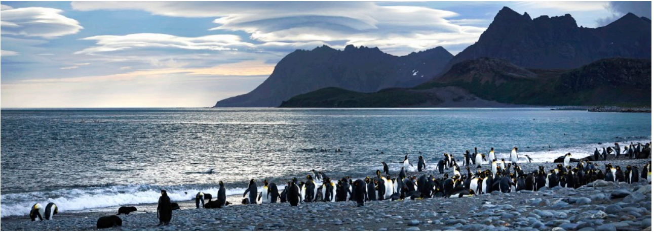
Dawn in the Bay of Isles.