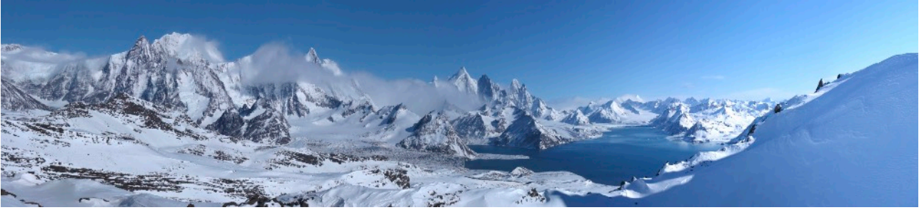
Cumberland West Bay from the summit of Narval Peak.

The desalinator insures enough fresh water for everyone to have regular hot showers and the boat is equipped with daily internet access. There is a large stock of both preserved food and fresh meat, cheese, fruit and vegetables on board, plus plentiful stocks of soft drinks, beer and wine. Although the crew are always excellent cooks, guests are encouraged to help with cooking too.