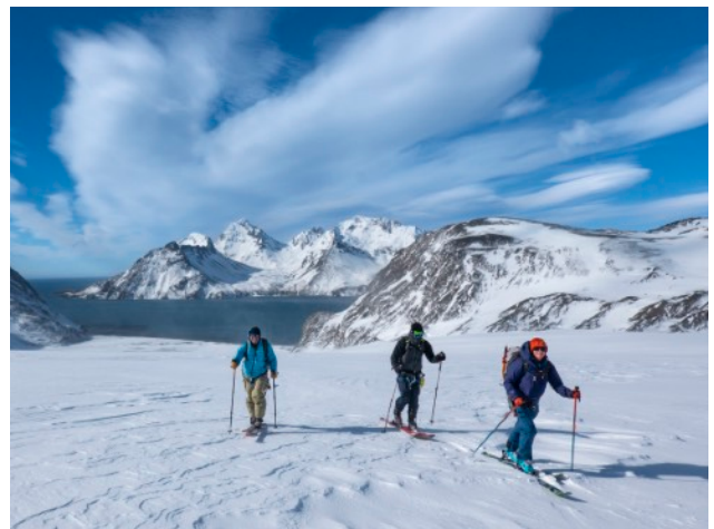
Skiing up to the Fortuna Glacier.