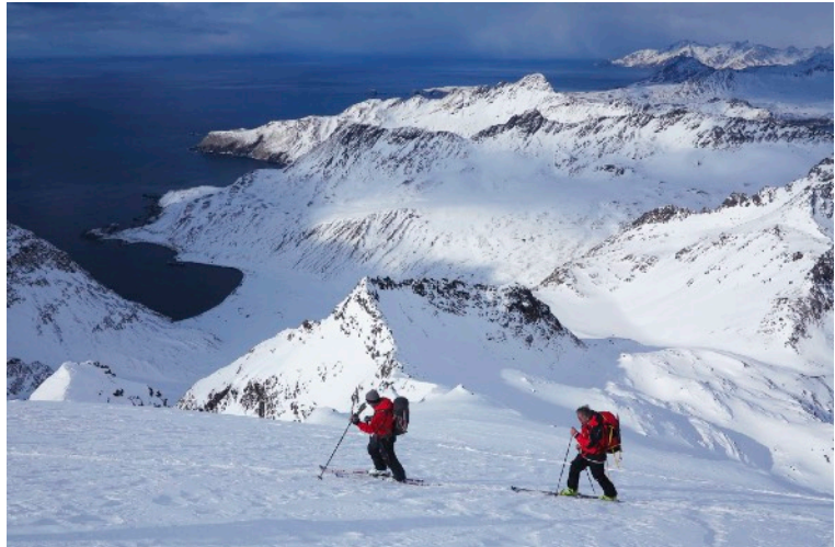
Ski ascent above Ocean Harbour and feeding time at St Andrews's.

For experienced skiers South Georgia offers fine off-piste skiing at the seaside, with penguins, seals and albatrosses for audience. Needless to say, there are no ski lifts, so we have to climb – usually on skins – to earn our descents. On five previous September expeditions we have nearly