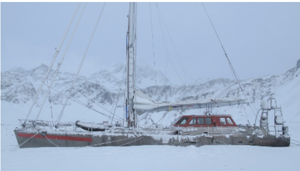
Iced in at Grytviken. Swimming at Grytviken.

South Georgia, like the British Isles, has a fickle climate, dictated largely by the prevailing westerlies, in this case blasting clockwise round Antarctica. It is quite a blowy place, famous in particular for the katabatic winds which sometimes funnel down off the glaciers to whip up the waves in the most sheltered anchorages. Which is why it is so reassuring to be in a large, robust, well heated vessel, with powerful twin engines and a hugely experience crew to operate her.