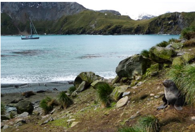
Fur seal watching over Elsehul.

Sept 7 Put ashore in Possession Bay. Ski up Purvis Glacier and cross col to Shackleton Gap, descending to Assistance Bay. (This tour could be extended by skiing down to King Haakon Bay to visit Pegotty Bluff.) Sail in afternoon to anchor at Husvik.