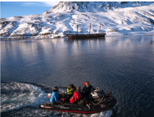
Going ashore in Ocean Harbour.