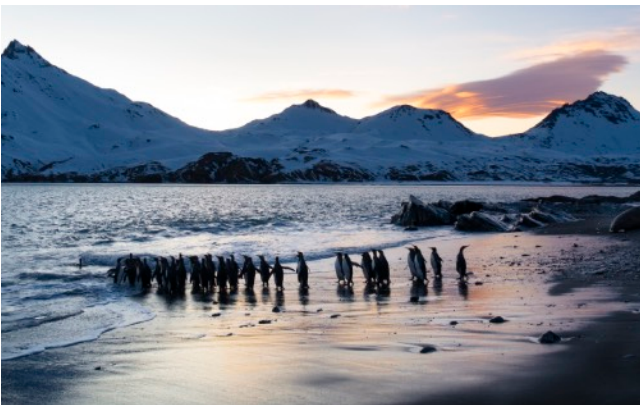
Dawn in Fortuna Bay.

Sept 12 Put ashore in Whistle Cove to ski final section of Shackleton Traverse to Stromness. Sail in afternoon to tie up at Grytviken.