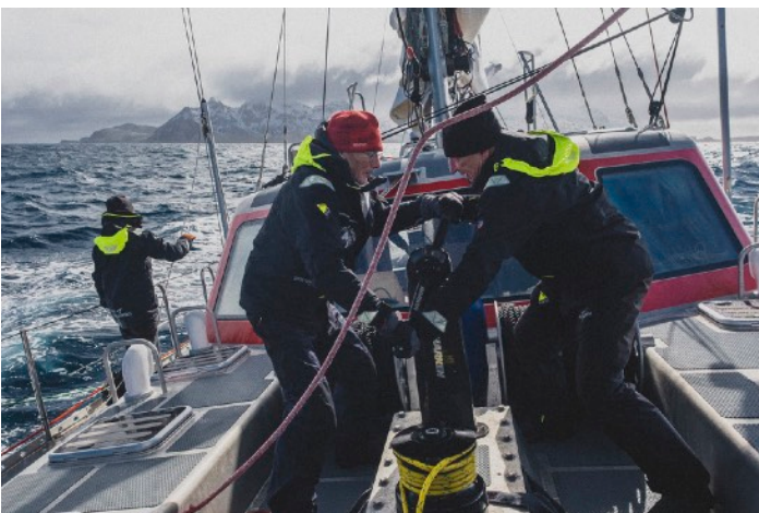
Taking in a reef off the south coast .

This is an opportunity to experience ocean sailing on a superlative vessel, with an extremely experienced skipper and crew. Guests are encouraged to help with sailing the boat, regardless of previous experience, and everyone does watches during the voyage from the Falklands to South Georgia, which usually takes four or five days.