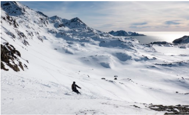
Skiing from Grytviken to Maiviken.

Because much of the north coast is not glaciated, it is safe for non-skiers to go for quite adventurous walks, using snowshoes if necessary. Many, many happy hours can be spent at places like St Andrew's Bay, just standing and watching the elephant seals, fur seals, petrels and penguins. And everyone will have a chance to visit the old whaling station and museum at Grytviken