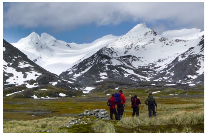
A morning walk up Hope Valley.

Sept 8 – 11 Put ashore in Fortuna Bay and ski up to Turnback Glacier for three nights camping on Fortuna Glacier; ski tours from camp. Return to Fortuna Bay.