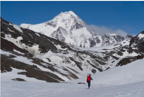
Above Grytviken and Shackleton's grave.