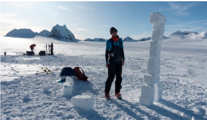
Art installation on the Esmark Glacier.