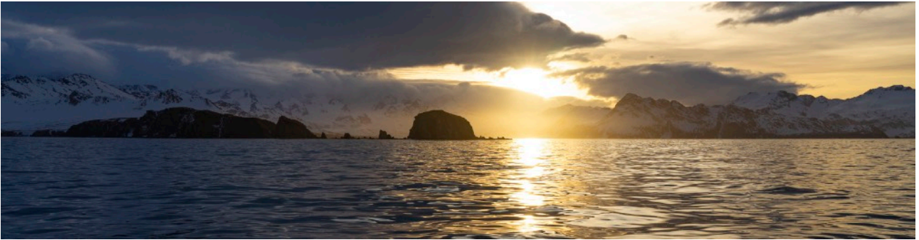
Sailing home from St Andrew's Bay to Cobblers Cove.

Nearer departure time, I will probably draw up a revised timetable. But that will almost certainly be revised again once we get to South Georgia!