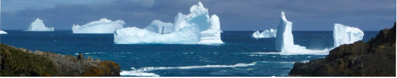
Icebergs off King Haakon Bay.