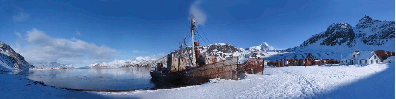
The old whaling station at Grvtviken.