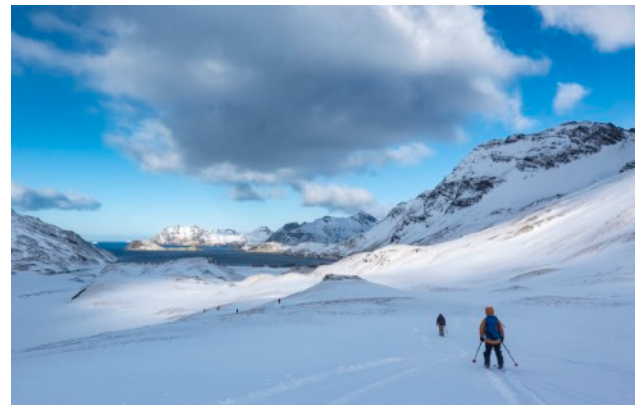
Shackleton's descent to Stromness.